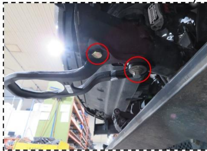
Figure 1d: Remove OEM tow loop (driver side shown)