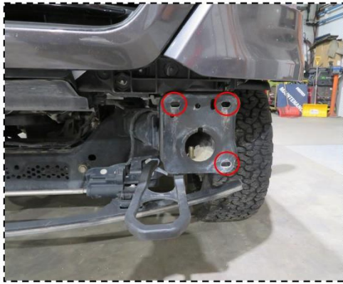
Figure 1c: Remove front fasteners (driver side shown)