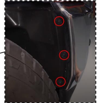
Figure 1a: Remove fender fasteners (passenger side shown)