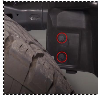
Figure 1b: Remove side fasteners (passenger side shown)