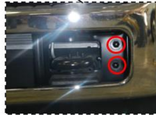
Figure 1c: Remove front fasteners