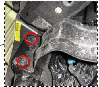
Figure 1b: Remove back fasteners (Driver Side Shown)