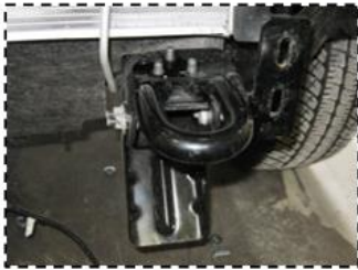
Figure 1d: Remove OEM tow loops and lower frame extensions