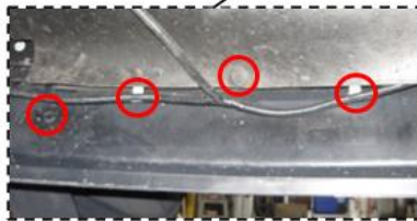
Figure 1a: Remove front bumper clips (view from under)